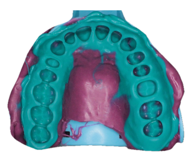
Figure 2: Maxillary impression using a two-step technique with light and regular body silicone materials

abutment clarity and the presence of voids or tears. All samples included in the study had a clear finish line without any defects, ensuring a usable impression (Figure 2). After visual assessment of the impressions, they were digitized using a Zirkonzahn scanner and primary Nissin typodont was chosen as the reference digital cast (Figure 3). Digital impressions were then superimposed to assess the accuracy of the impressions. Digital impressions were aligned and overlayed to impressions of the reference cast and alignment was performed using reference points or landmarks on the casts to ensure precise positioning. After superimposing the digital impressions, the overlapping areas were measured using digital calipers and specialized software tools in Exocad. We measured six specific parameters related to the