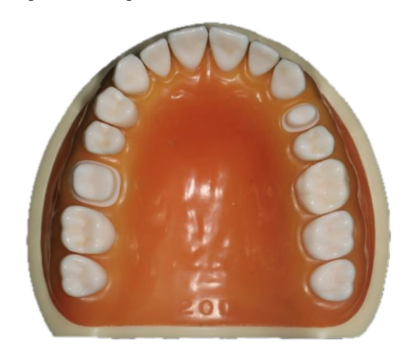
Figure 3: Reference cast of Nissin typodont used as a control for dimensional accuracy comparison

abutment clarity and the presence of voids or tears. All samples included in the study had a clear finish line without any defects, ensuring a usable impression (Figure 2). After visual assessment of the impressions, they were digitized using a Zirkonzahn scanner and primary Nissin typodont was chosen as the reference digital cast (Figure 3). Digital impressions were then superimposed to assess the accuracy of the impressions. Digital impressions were aligned and overlayed to impressions of the reference cast and alignment was performed using reference points or landmarks on the casts to ensure precise positioning. After superimposing the digital impressions, the overlapping areas were measured using digital calipers and specialized software tools in Exocad. We measured six specific parameters related to the